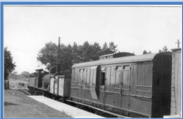
The DVLR's ex-SE&CR brake van and BR(E) ex-NER class J25 seen in the 1950s

A number of enthusiast trains were operated by the DVLR during the late 1970s and early 1980s in conjunction with the National Railway Museum. Currently, the only remaining section of the line is that based at Murton Park.